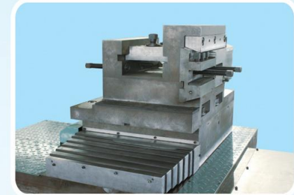
框式刀架 Turret tool holder