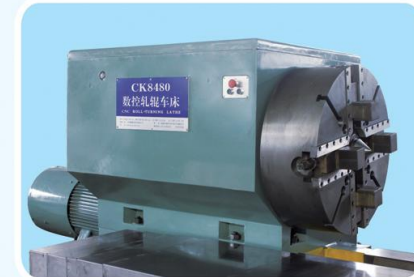
重载车头箱 Lathe head